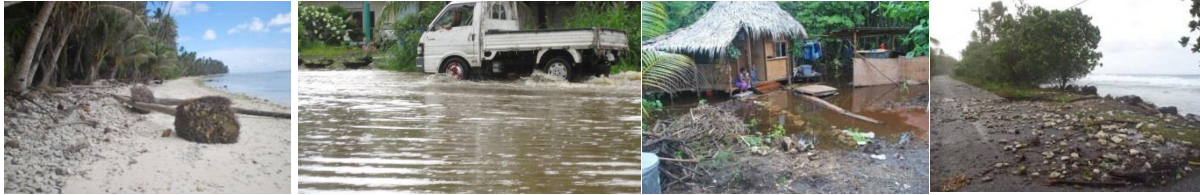
Coastal erosion, flooding, and wave overwash in Kosrae