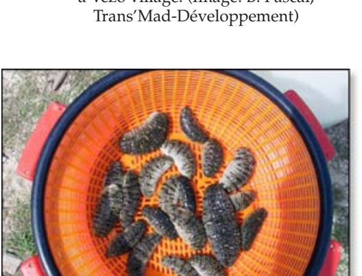
Figure 4. Hatchery-reared juvenile H. scabra.