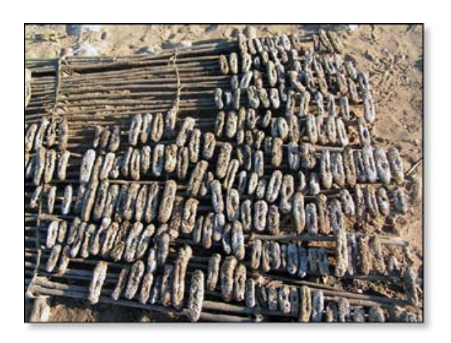
Figure 2. Wild sea cucumbers drying in a Vezo village.