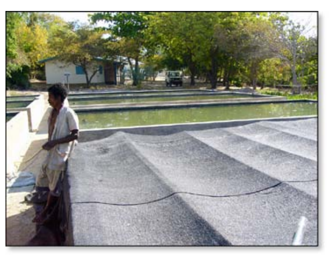
Figure 3. The sea cucumber nursery at Belaza, southwest Madagascar.