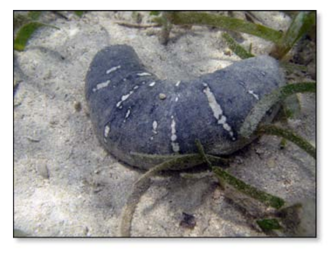
Figure 6. Commercial size H. scabra reared by the Women's Association.