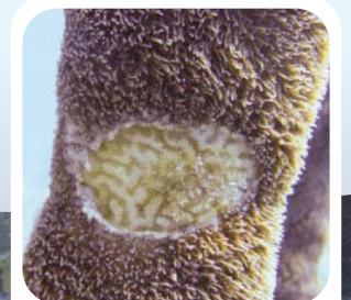
Sloughing away of tissue