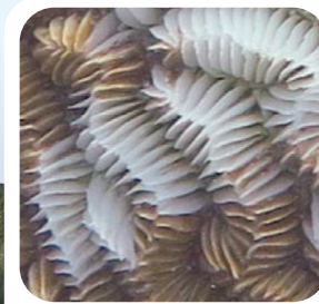
Bare skeleton with no tissue

Some disease is normal on reefs, affecting 2-3% of corals